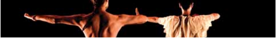
MANGO CHERRY MIX PAGE NO. 12-13