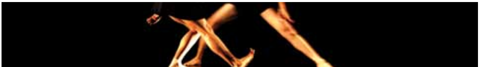
INHABITED GEOMETRY PAGE NO. 16-17