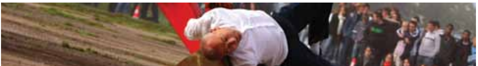
TRANSPORTS EXCEPTIONNELS PAGE NO. 22-23