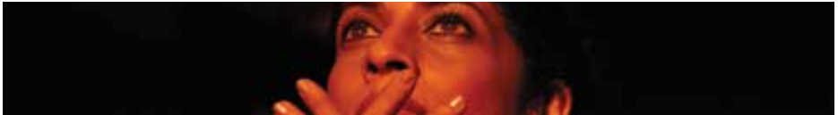
TIMELESS PAGE NO. 14-15